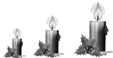
Third Sunday of Advent

Notice: Please be advised if you are using 2010 envelopes we are not able to record your donations without your name. All 2010 numbers that were not active were deleted in January 2011.